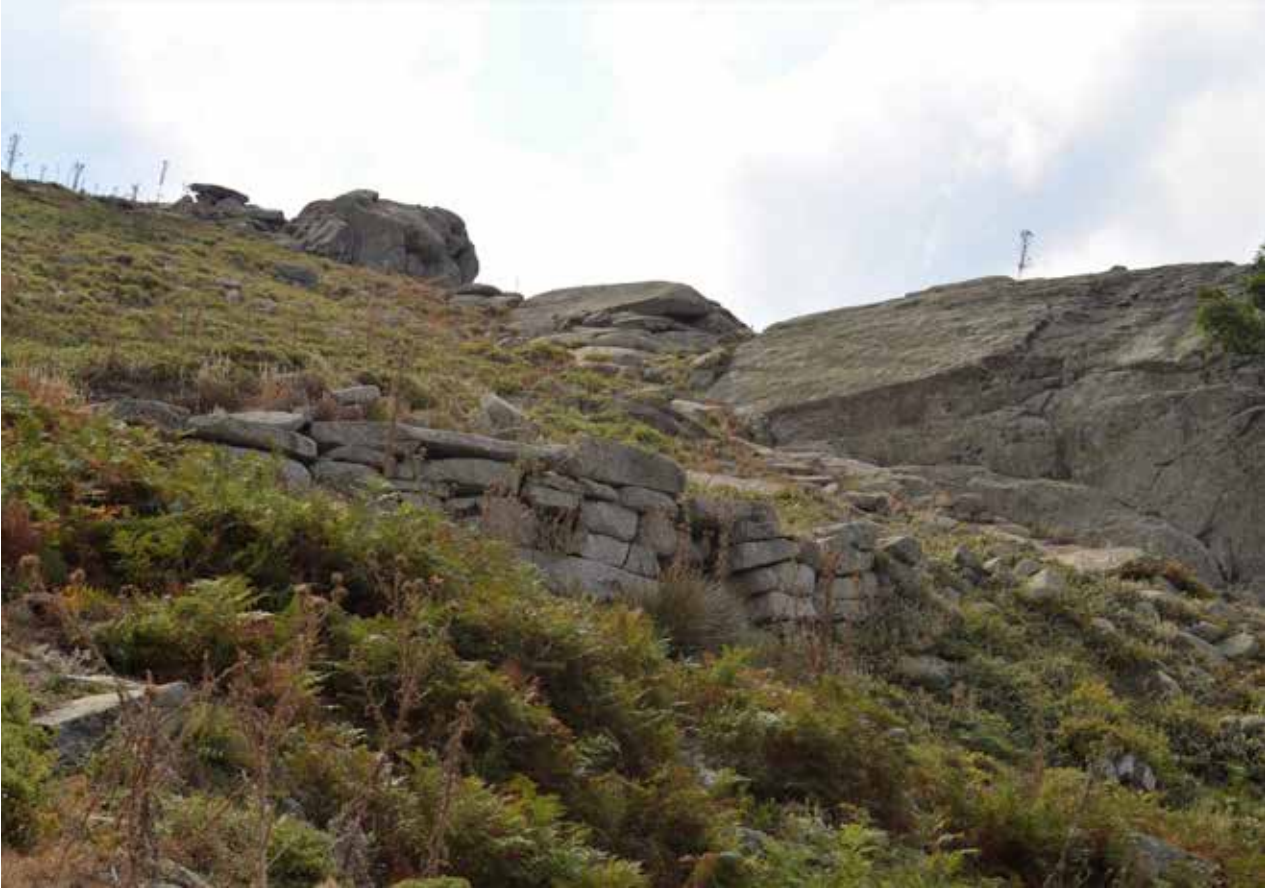
Fig. 3: Marmara Island, Çınarlı (Galimi), wall remains above the village