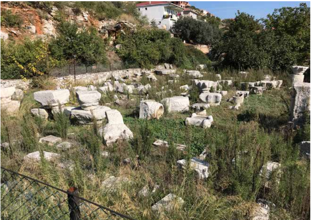
Fig. 6: Marmara Island, Saraylar, general view of the Open-Air Museum

Historic texts and references about Marmara Island are few for these centuries; however, archaeological findings indicate that marble quarries continued to operate effectively on the island. The findings, which were unearthed by an excavation team led by archaeologist N. Asgari and are currently exhibited in the Saraylar Open-Air Museum, indicate that the marble quarries on the island continued their activities (Fig. 6) (Asgari 1981, 117-118). Ambo, column capitals, parapet panels, and ciborium pillars made from Marmara marble were used in civic and religious architecture almost everywhere along the Mediterranean coast during the early Byzantine period. Constantine the Great (4 th century) built a circular forum (Forum Constantinus, today's Çemberlitaş) during the reconstruction of the city of Byzantium (Istanbul) –which would be called after his own name– at the location of the old city gate and placed two gigantic arches in this area using marbles brought from Proconnesus (Zosimus 2.30). Proconnesian marble was also used in the decoration of the Hagia Sophia in Constantinople. It is possible to see architectural elements made from