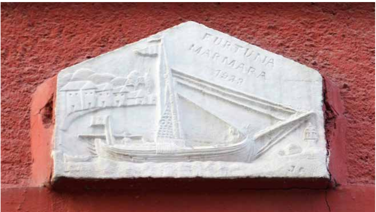
Fig. 8: Plaque with ship depiction and inscription "Furtuna Marmara 1933" from a house in Balat, Istanbul.

There are several other islands in the south of Marmara Sea that are of various sizes, with or without settlements. While settlements are found on islands such as Paşalimanı, Avşa, and Ekinlik, there are not any on Koyun Island, islets such as Mamali, Yera, Hasır, or –to the east of the Cyzicus (Kapıdağ) Peninsula– islets such as Fener, Soğan, Hali, and Sedef. Nevertheless, there are still churches, chapels, and lighthouses that are of importance for cultural heritage on islands such as Koyun, Yera, and Fener.