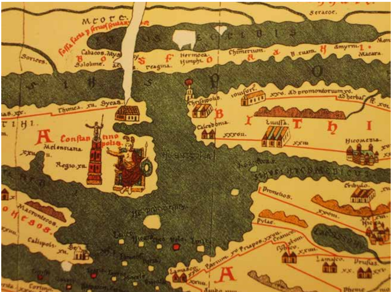
Fig. 2: Detail from Tabula Peutingeriana showing Marmara Island (from Prontera 2003)

According to Pomponius Mela (II.99), who lived in the 1 st century, Proconnesus was the only inhabited island among those of the Propontis. Ptolemy, a 2 nd -century author, talks about Proconnesus Island in Propontis and gives its coordinates (III.11.8). According to Appian, another 2 nd -century writer, a Roman army sailed to Proconnesus in 35 BC to go after the rebel-general Sextus Pompey, who conquered Nicaea (Izmit) and Nicomedia (Izmit) (V.14.139). According to another 2 nd -century author, Pausanias, the people of Cyzicus, who forced the people of Proconnesus to live in Cyzicus by war, took away a Mother Dindymene (Cybele) statue from Proconnesus around 1 st century BC (VIII.46.4).