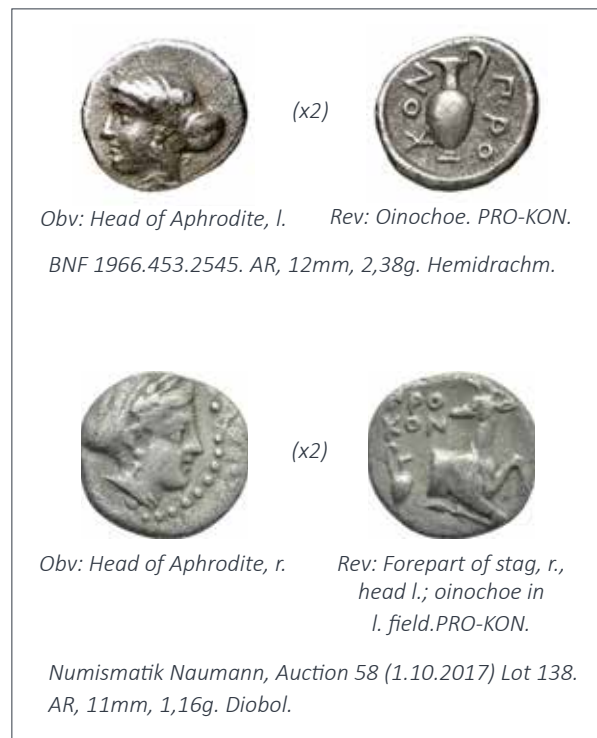
Fig. 1: Examples of silver coins minted by the Proconnesus city-state

Xenophon (4 th century BC) also mentions some of the phases of the Battle of Cyzicus (410 BC), the extension of the Peloponnesian War (431-404 BC), which took place about Proconnesus, but does not give specific information about the island (I.1.13- 14, 18, 20; I.3.1). 3 Proconnesus is mentioned briefly in relation to the struggles of the Spartan admirals named Anaxibius and Antalcidas against the Athenian navy in 389 and 387 BC (Xenophon IV.8.36, V.1.26).