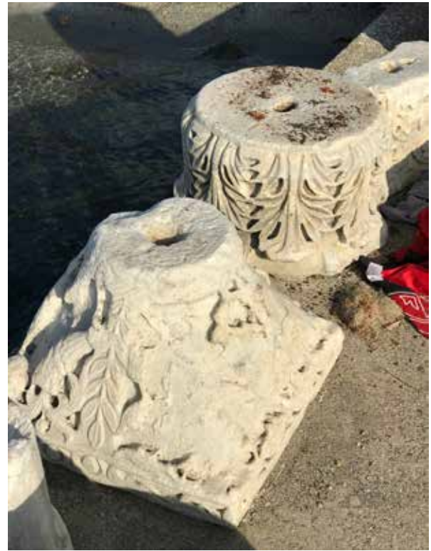
Fig. 5: Paşalimanı Island, Tuzla, artefacts of Antiquity and the Byzantine period at the harbour

Proconnesus Island is shown as “Ins. Proconessus” in Tabula Peutingeriana , a Roman road map dated to the 4 th -5 th century AD. It is marked just south of Constantinople and shown to be quite larger than all the other islands around it (Fig. 2).