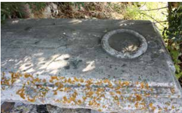
Fig. 9: Paşalimanı Island, tombstone of Theodoros.

The island has five settlements. Vourgaro (Paşalimanı) and Aloni (Harmanlı) are located in the western bay of the island, which is a natural harbour, whereas Vori (Poyrazlı) is located in the northern bay. Houhlia (Tuzla) in the east is a small peninsula connected to the island with a very thin isthmus. On the south coast is Skoupia (Balıklı) settlement, which is still an active port.