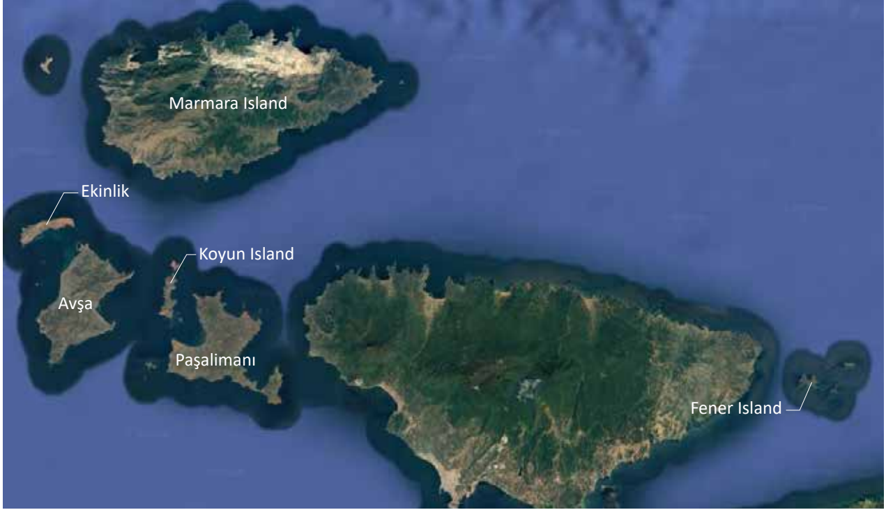
General Map of the Islands in Southern Marmara