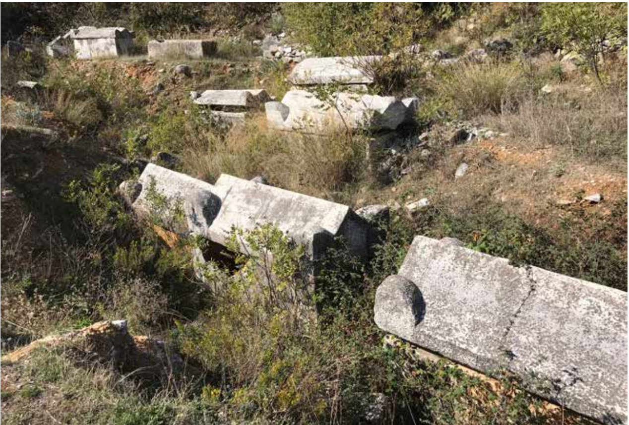
Fig. 4: Marmara Island, Saraylar, Roman-period necropolis