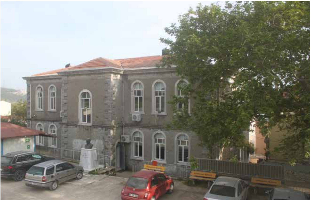
Fig. 2: Northern façade

On the building's northern façade, there is a second entrance in the middle of the rectangular mass, protruding from the façade.