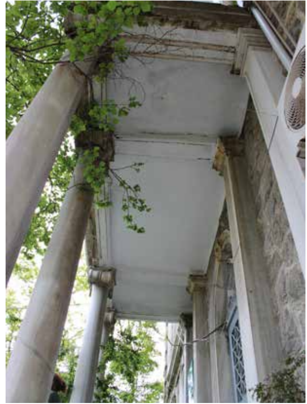
Fig. 3: Connection detail for column capitals

The structure was constructed in rubble masonry and reinforced concrete. This technique may be observed on the ground and first floors as well as on the southern, eastern, and western façades. Stairs and flooring were