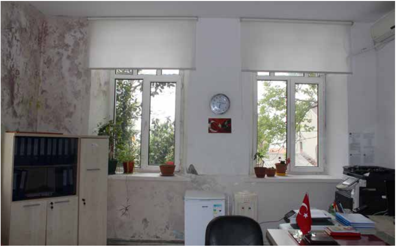
Fig. 4: Deterioration

be evaluated as positive. It is important that historical buildings have valuable usage for the conservation and continuity of the architectural heritage. Severe structural damage is not observed; therefore, it can be stated that the building does not have any structural damage.