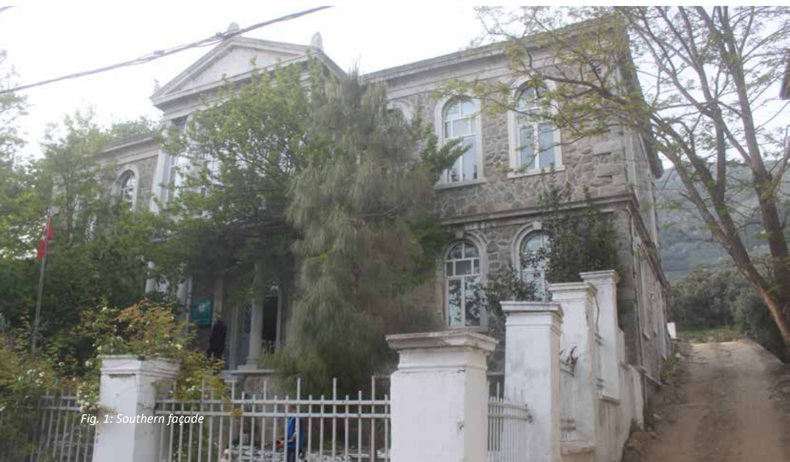
Fig. 1: Southern façade

The architect of the building was Dimitrios Karagiannakis (Δημήτριος Καραγιαννάκης), who was brought from Istanbul. His name is still inscribed on a marble console on the façade. In addition, the architect's initials –Δ and Κ– were engraved on some of the granite blocks in the walls. On the marble architrave