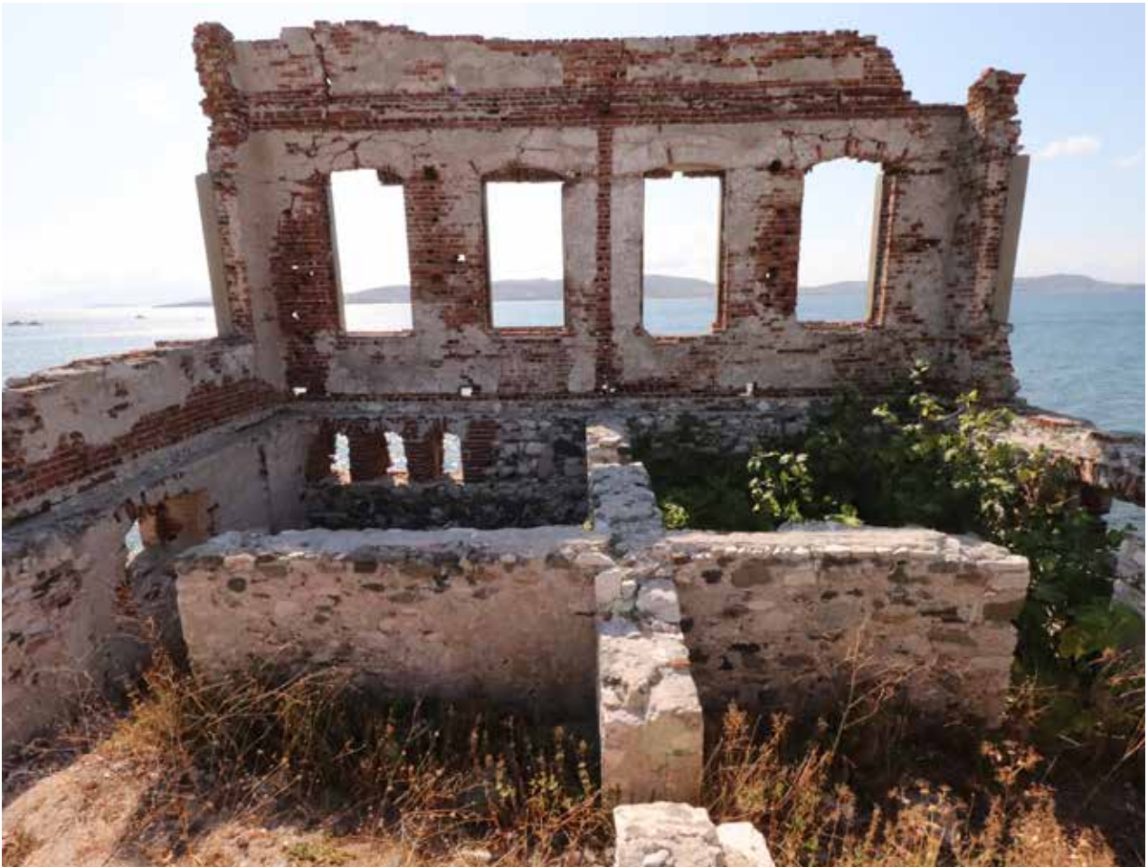
Fig. 2: Ekinlik Greek School for Girls, partition walls in the basement and the southern wall of the ground floor

The school has a settlement area of about 160 m 2 and a square layout. There is a level difference in the north-south direction (Fig. 1). The façade organizations of the basement and ground floor are discernible from the south. On the north façade, only the basement floor plan and traces of interior partition walls are distinguishable (Fig. 2). The entrance staircase to the west of the building provide access to the ground floor. The extant steps indicate that the stairs rising from the sea direction (south) to the north and turning east at the ground floor level connected to an opening on the western façade at the ground floor level.