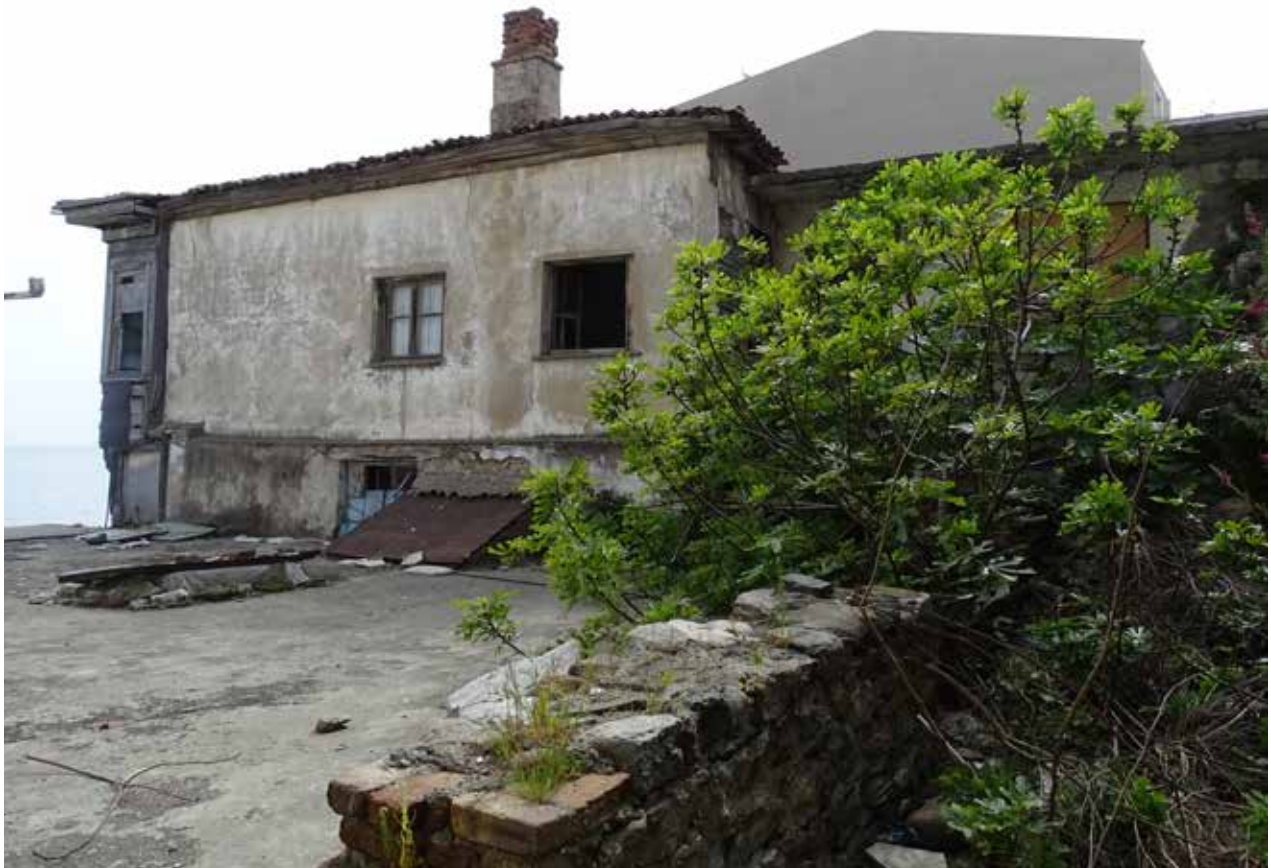
Fig. 2: Eastern façade

The measurements of the timber ceiling on the ground floor were taken during the field survey. The ceiling arrangement is composed of 4 cm wide wood laths with profile widths of 1.5 cm on both sides, which were placed at 16 cm intervals. The brackets supporting