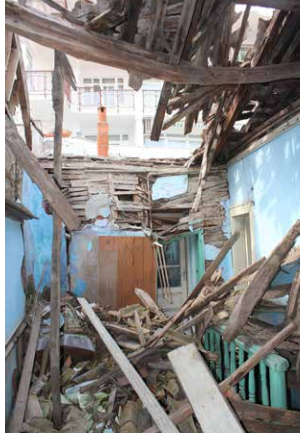
Fig. 4: Collapsed roof and damaged second floor

There are structural problems and deteriorations due to the abandonment of the building. The partial collapse of the roof exposed the second floor to effects of rain, snow, and wind, thus it necessitates urgent intervention. The lack of protection against the elements poses a threat to the ground and first floors, which are overall well preserved. The loss of material of plaster and cracks in this layer are observed on all of the walls. Some of the flooring has caved in due to the roof's collapse. There is loss of material in the timber, overlapping panels on the façade, the ceiling of the main entrance hall, and the timber brackets supporting the projections.