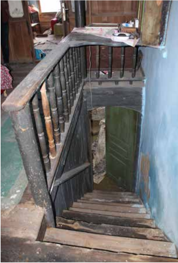
Fig. 3: Stairs between the ground and first floors

the projections are timber. The building has a hipped roof, covered with over and under tiles.