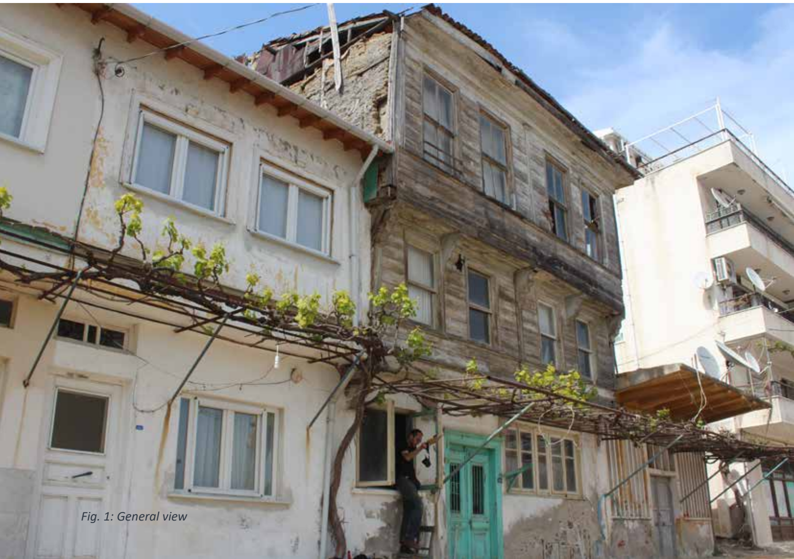
Fig. 1: General view

Metin Doğantimur's House is approximately 21.5 m away from the Marmara Sea as the